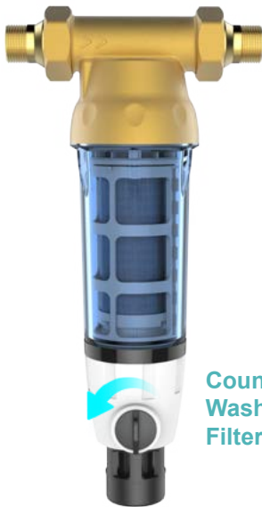
Counter Spray Washing With Filtered Water